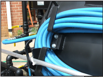
Figure 1 (above)