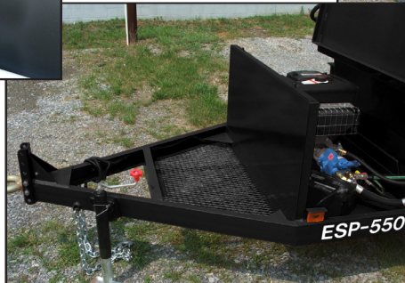
Figure 2 (right)