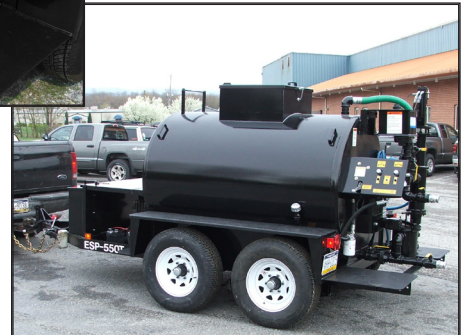
Figure 4 (below)